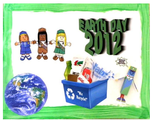
Emaryl's Girl Scout Poster

Although it's been said many times, many ways (Iroquois-Ojenyunyat Sungwiyadeson