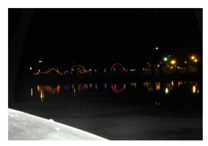
Reflections of Santa Land

Although it's been said many times, many ways (Iroquois-Ojenyunyat Sungwiyadeson